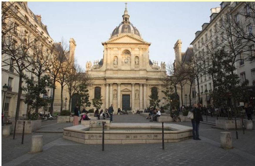
Université de Paris