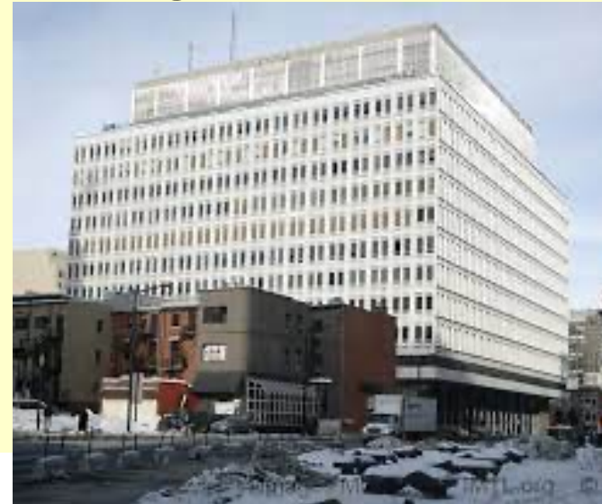
Sir George Williams University