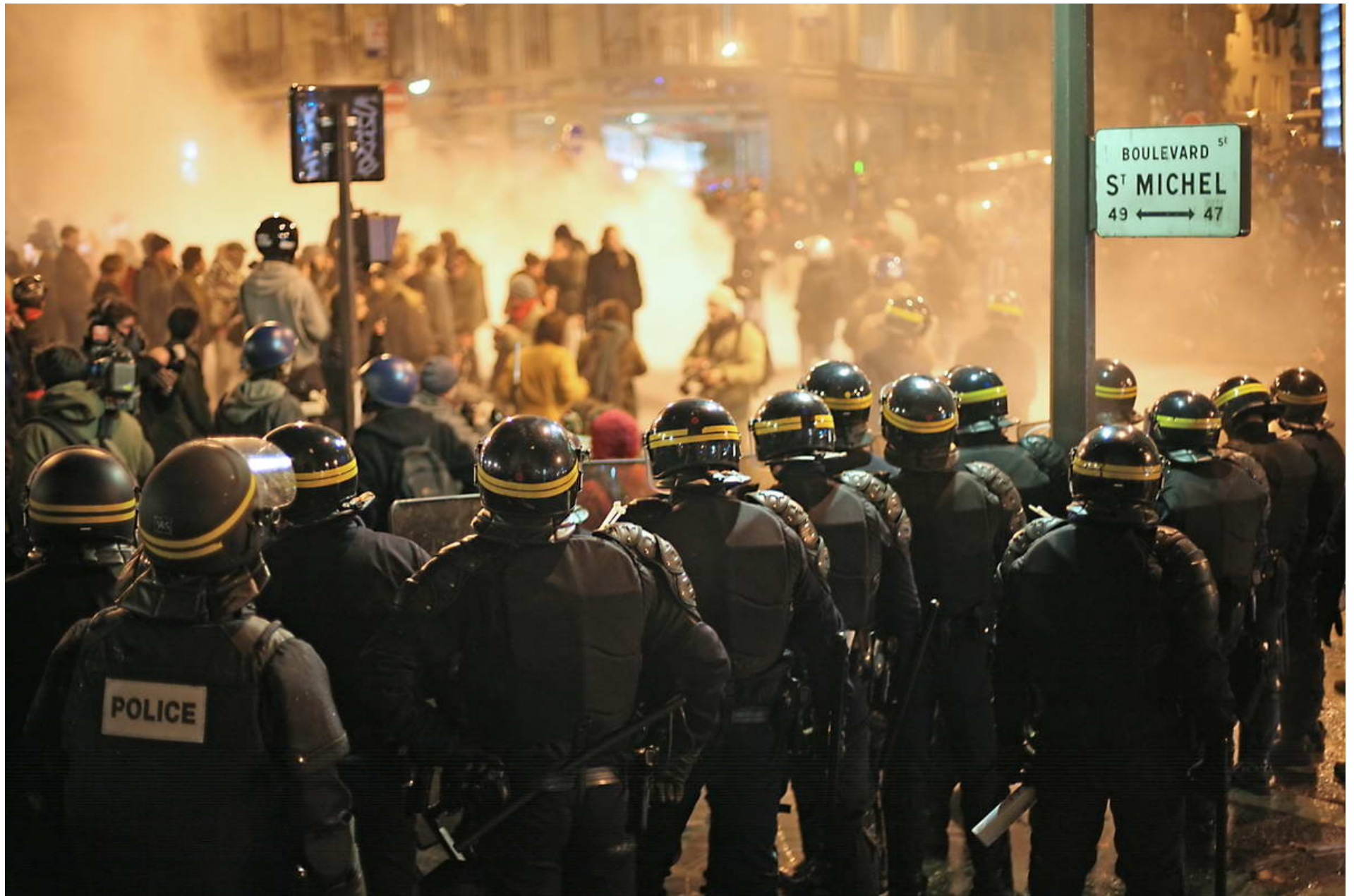
Paris, May 1968