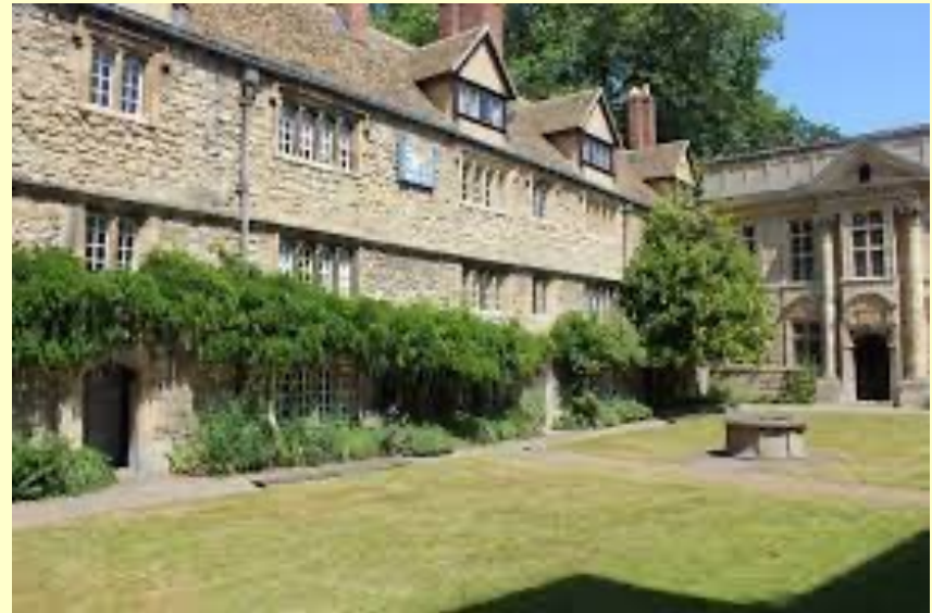
St. Edmund Hall, Oxford