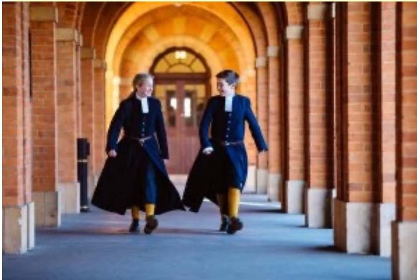
Christ's Hospital School