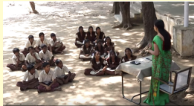
COL'S Classroom without Walls

Virtual University for Small States of the Commonwealth PARTICIPATING COUNTRIES