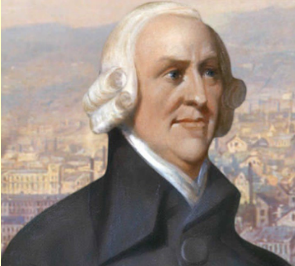
Adam Smith 1723-1790