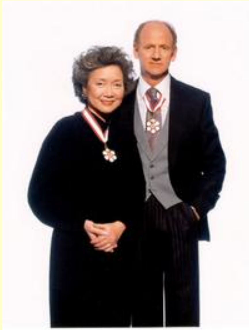
Adrienne Clarkson & John Ralston Saul